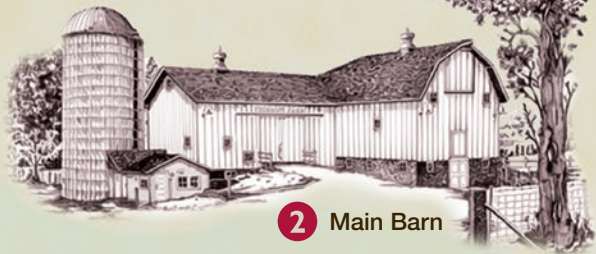
2 Main Barn