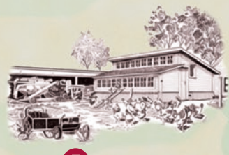
5 Chicken Coop