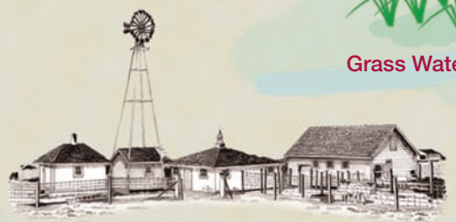
1 Windmill, Pump House & Sheep Shed