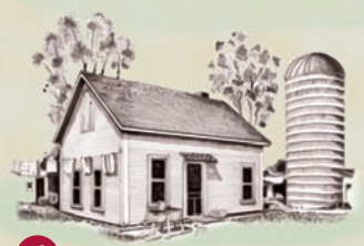
4 Summer Kitchen