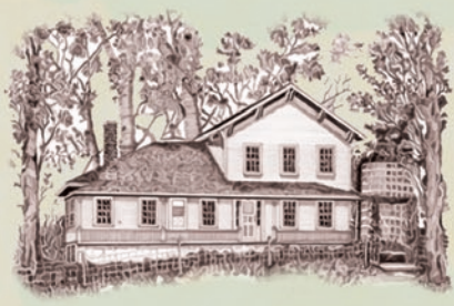
3 Farm House